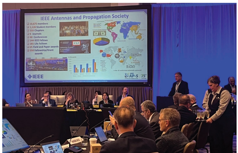
FIGURE 4. Members of this prominent IEEE audience were truly impressed by AP-S accomplishments, and the celebration culminated with a standing ovation congratulating us on the fantastic 75 years and the “Happy Birthday to You” song.

In addition to the AP-S AdCom meeting, we organized and ran an official IEEE TAB Celebration of the 75-year jubilee of AP-S as the third oldest IEEE society in Orlando. The celebration took place on 16 February as part of the official, announced agenda of the IEEE TAB Meeting, as shown in Figure 2 . This was a rather important