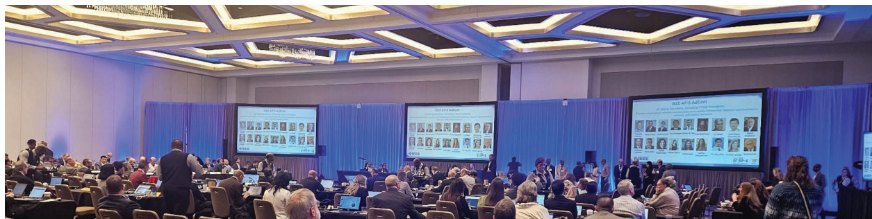
FIGURE 2. The AP-S 75 Years Celebration during the IEEE Technical Activities Board Meeting on 16 February 2024 in Orlando, FL, USA, with 12 AP-S leaders onstage and more than 200 IEEE leaders and Society/Council Presidents attending.

Technical Committees. Whereas the former TCAM will become one of the TCs, and the list will include the TC on Future Directions and TC on