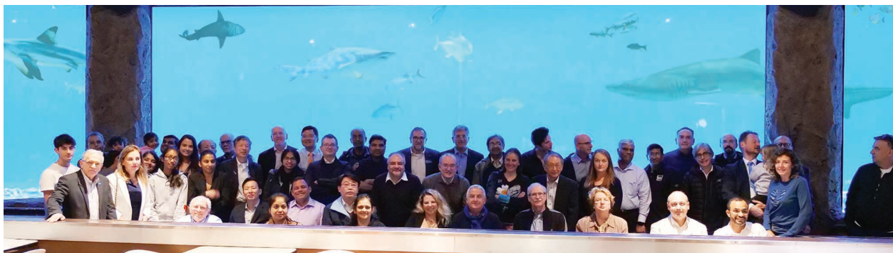
FIGURE 1. IEEE AP-S AdCom at-Large Members during the AdCom dinner, after a very long day of presentations and discussions, on 17 February at the SeaWorld Sharks Underwater Grill, as part of our winter AdCom meeting on 17–18 February 2024 in Orlando, FL, USA. Also shown in the photo are some family members as well as some IEEE and IEEE Microwave Theory and Technology Society dignitaries/guests. Nearly the entire AdCom at-Large participated in person in Orlando.

Society Vice Presidents. Perhaps the most fundamental change approved by the AdCom in Orlando is the establishment of Society Vice Presidents (VPs). Namely, AP-S will have five VPs to enhance the coordination and operation of the Society and help the President as follows: VP of Professional Activities, VP of Technical Activities, VP of Operations and Finance, VP of Publications, and VP of Conferences. VPs