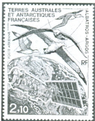
Albatrosses Are Tracked Over The Austral Ocean FSAT (Scott C114)

The first of several stamps of the French Southern and Antarctic Territories (FSAT) (1992/Scott C50) includes several icons in small circles on the stamp. One of these circles shows a polar bear, possibly wearing a harness and radio transmitter. That appears to be an indication of the use of Argos , although there are no polar bears in the Antarctic. However other organizations have carried out Arctic polar bear research using the Argos system. For example, between 1985 and 2005, American and Canadian researchers used satellite telemetry and the Argos system to track a large number of female polar bears in northern Alaska, the western Canadian Arctic, and the southern Arctic Ocean. The purpose was to determine the changes in distribution of maternal dens for the polar bears.