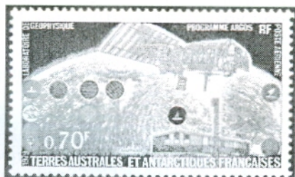
Polar Bear In Circle May Have Transmitter FSAT (Scott C50)

Another pre- Argos system was carried on Nimbus-6 , launched in 1974, primarily for tracking and receiving data from high-altitude meteorological balloons. But the system was also used to track two polar bears, a loggerhead turtle, and two wild Hawaiian spotted dolphins. No postal covers have been found for this system.