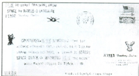
Cover Confirms Nimbus-3 Tracked Elk Wearing Transmitter In Wyoming