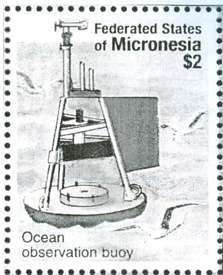
Argos Collects Data From Ocean Buoys Micronesia (Scott 297)

to Argos is found on a 1978 launch cover for TIROS-N , the first satellite to carry the system. The Argos name is not mentioned but the cachet on the cover notes a "Data Collection System" as one of the sensors on this satellite; this was the first of a new generation of NOAA satellites. Argos has been carried on all NOAA satellites from that time forward.