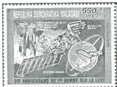
Argos Conducted Tracking Program For Elephants Malagasy (Scott 969)

The last stamp pictured that mentions Argos was issued by the Malagasy Republic (1990/Scott 969). It shows elephants, and the text on the stamp notes a tracking program for elephants in Namibia. The authors were unable to unearth details of the Namibian elephant tracking, but it is known that other elephants have been tracked using Argos in Malaysia, Thailand, and Sri Lanka. Satellite telemetry made it possible to follow them over an area of some 7,000 square kilometers. Such a large range precludes ground tracking, and tracking by aircraft would have been prohibitively expensive.