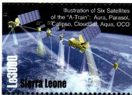
Sierra Leone Scott 2871d Michel 4976 (2006) [only one stamp from a souvenir sheet of four is shown] [left to right: EOS-Aura, PARASOL, CALPSO, CloudSat, EOS-Aqua, and OCO]

A second stamp issued by Tanzania in 2008 shows a 5-satellite A-train constellation, the most common configuration for several years during the early A-train. The only difference from the first stamp is that OCO-1 is not depicted, but as already mentioned OCO-2 was not launched as a replacement and did not become part of the A-train until many years later.