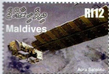
Maldives Islands Scott 2895d Michel 4543 (2006)

satellite in the A-train constellation. A large depiction of EOS-Aura is found on another stamp in the same miniature sheet from Maldives Islands which contained a stamp showing Aqua. Other postal items can be found online.