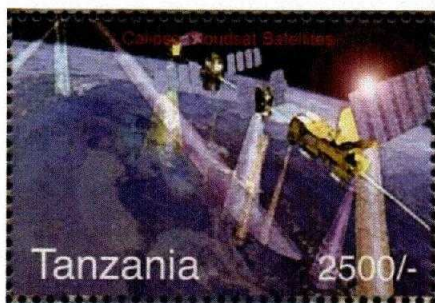
Tanzania Scott 2444 Michel BL592 (2008) [only the stamp from a souvenir sheet of one is shown] [left to right: EOS-Aura (just off top edge of stamp), PARASOL, CALIPSO, CloudSat, and EOS-Aqua]

A second stamp issued by Tanzania in 2008 shows a 5-satellite A-train constellation, the most common configuration for several years during the early A-train. The only difference from the first stamp is that OCO-1 is not depicted, but as already mentioned OCO-2 was not launched as a replacement and did not become part of the A-train until many years later.