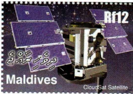
Maldives (Maldivian Islands) Scott 2895b Michel 4541 (2006)

5) CALIPSO (Cloud-Aerosol Lidar and Infrared Pathfinder Satellite Observation) is a NASA-French (CNES) joint venture that was launched along with CloudSat on 28 April 2006. Similar to CloudSat, CALIPSO's three instruments are only nadir-viewing, with one instrument being an active cloud-aerosol lidar, operating at light wavelengths rather than the radio wavelengths of radar measurements. CALIPSO was placed in the middle of the A-train constellation next to CloudSat. A number of postal items have featured both CloudSat and CALIPSO. (Most of these items are similar in design and were issued by countries having nothing to do with any of these satellites. These items are likely being produced primarily to sell to collectors, while finding limited (if any) postal use.) CALIPSO was moved out of the A-train in September 2018 to CloudSat's new (lower) orbit, to be part of the C-train. A souvenir sheet of one stamp from Guyana nicely depicts CALIPSO with CloudSat in the background, since they have been together in the A-train and later working together in the C-train.