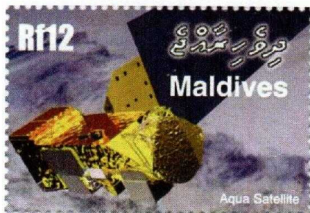
Maldive Islands Scott 2895c Michel 4542 (2006)

2) EOS-Aura , a satellite with an atmospheric chemistry observing mission, was launched on 15 July 2004. (EOS-Aura should not be confused with the French D-series satellite (D-2B/Aura) which goes by the same name). Aura was designed to monitor ozone and related molecules in the stratosphere (upper parts of the atmosphere) and troposphere (lower atmosphere). Aura is a large satellite like Aqua, and is the last/trailing