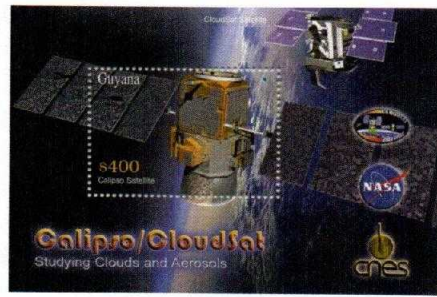
Guyana Scott 3931 Michel BL804 (2006)

5) CALIPSO (Cloud-Aerosol Lidar and Infrared Pathfinder Satellite Observation) is a NASA-French (CNES) joint venture that was launched along with CloudSat on 28 April 2006. Similar to CloudSat, CALIPSO's three instruments are only nadir-viewing, with one instrument being an active cloud-aerosol lidar, operating at light wavelengths rather than the radio wavelengths of radar measurements. CALIPSO was placed in the middle of the A-train constellation next to CloudSat. A number of postal items have featured both CloudSat and CALIPSO. (Most of these items are similar in design and were issued by countries having nothing to do with any of these satellites. These items are likely being produced primarily to sell to collectors, while finding limited (if any) postal use.) CALIPSO was moved out of the A-train in September 2018 to CloudSat's new (lower) orbit, to be part of the C-train. A souvenir sheet of one stamp from Guyana nicely depicts CALIPSO with CloudSat in the background, since they have been together in the A-train and later working together in the C-train.