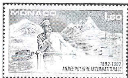
Prince Louis Discovery Monaco (Scott 1358)

was vital in such work. Weyprecht's dream had come true.