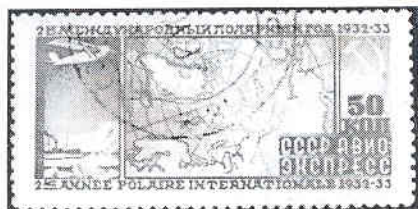
Icebreaker Sibiryakov First To Sail Northeast Passage Russia (Scott C34)

al cooperative program making observations in those fields of study in the Arctic and Antarctic would bear scientific fruit that would find application in weather forecasting, wireless telegraphy, terrestrial magnetism, and marine and aerial navigation. The proposal was submitted to the International Conference of Directors of Meteorological Services in Copenhagen in 1928 where it was approved. The second IPY took place during the years 1932-1933, fifty years after the first IPY.