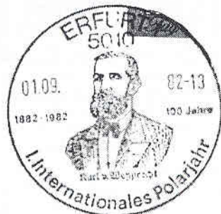
Karl Weyprecht Depicted On DDR 1982 Postmark

tional cooperation in meteorology. The idea of international collaboration in other sciences was not far behind.