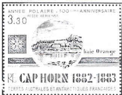
1882-1883 Orange Bay Base At Cape Horn FSAT (Scott C74)

result, the International Polar Commission was formed later that year with the mandate of developing a detailed research plan. Unfortunately Weyprecht died in 1881, and it was left to von Neumayer and the commission to move forward.