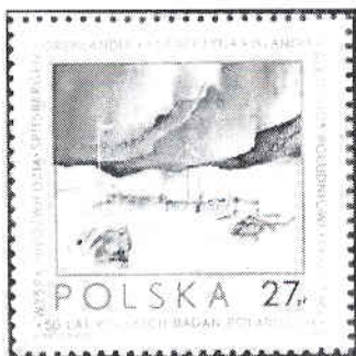
IPY 50th Anniversary Noted With Base In Greenland Poland (Scott 2541)

various Russian stamps (1935/Scott C59, 1966/Scott 3191A, and 1980/Scott 4885). Otto Schmidt, the Sibiryakov which also can be seen on Russia (1977/Scott 4579), and the route Schmidt followed are also depicted on a Belarus souvenir sheet (2001/Scott 406).