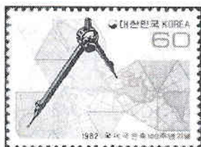
Protractor On Map For IPY Centennial Korea (Scott 1289)

The main scientific studies carried out were in the areas of meteorology, auroral studies, atmospheric electricity, and geomagnetism. Work in the areas of glaciology, geomorphology, botany, sea ice, and oceanography was also undertaken. Ethnographic studies of the native people were also carried out in Tierra del Fuego and in several other locations. The work completed during the first IPY established a standard for subsequent geophysical research in the polar areas, and demonstrated that international collaboration