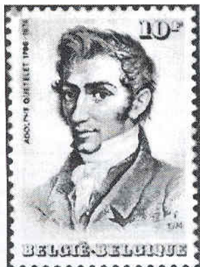
Adolphe Quetelet Was Observatory Director Belgium ( Scott 885)

Another approach was introduced in the late 19th century. Its roots can be traced to the 1853 International Marine Conference in Brussels whose goal was to create a common international framework for meteorological observations at sea. Adolphe Quetelet (1796-1874), at the time director of the Belgian Royal Observatory, served as president of the conference (Belgium, 1974/ Scott 885). The conference had a strong meteorological component and provided the impetus for the establishment of the International Meteorological Organization (IMO) in Vienna, Austria, in 1873. The IMO provided a permanent framework for interna-