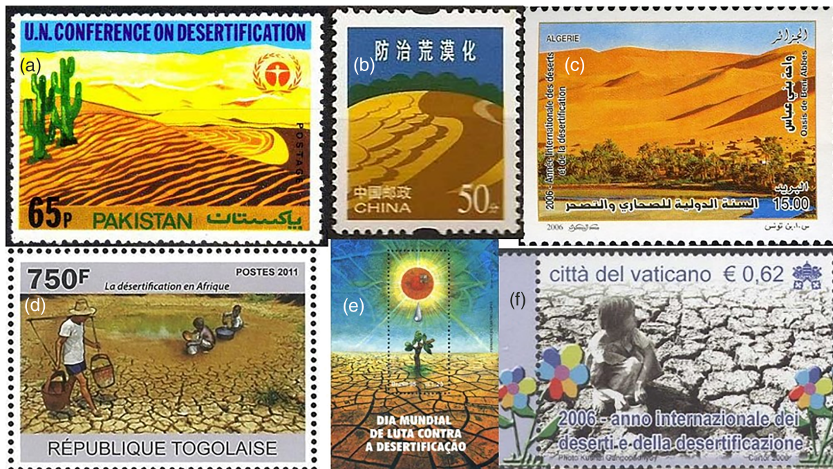
FIGURE 2 Postage stamps intended to draw attention to desertification and associated events, which illustrate the common misunderstanding of the nature of desertification. That is, the (a–c) spreading desert and (d–f) cracked soils (Toth & Hillger, 2012) [Colour figure can be viewed at wileyonlinelibrary.com ]

Although sand movement does occur under the action of wind, dunes encroaching on cultivated land and settlements as a result of human actions is a minor phenomenon (Bellefontaine et al., 2011). In China, where degradation by sand movement (‘sandification’) is a major problem, only 5.5% is said to be caused by encroachment at the edges of existing dunes and sand sheets (Wang, 2004). Damage caused by inappropriate tillage practices, overgrazing by livestock,