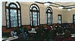
The TILT Building Great Hall