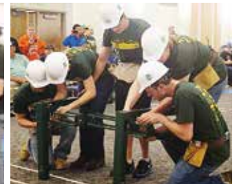
Steel Bridge competition in Johnson Hall. CSU's bridge failed, however, it weighed a record 400-plus pounds – a first.