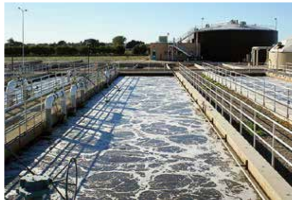
Modifications to existing treatment process provide cost-effective nitrogen and phosphorous removal.

When excessive nitrogen and phosphorus enter our waterways – usually via stormwater runoff and industrial activi-