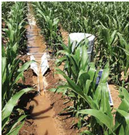
End of field monitoring of cropping systems.