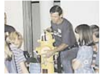
Nearly 2,000 local third-grade students attended the 10th annual Fort Collins Children's Water Festival.

tion, USDA, American Red Cross, USGS Biological Resources Division, as well as several private businesses, are all enthusiastic presenters at the festival.