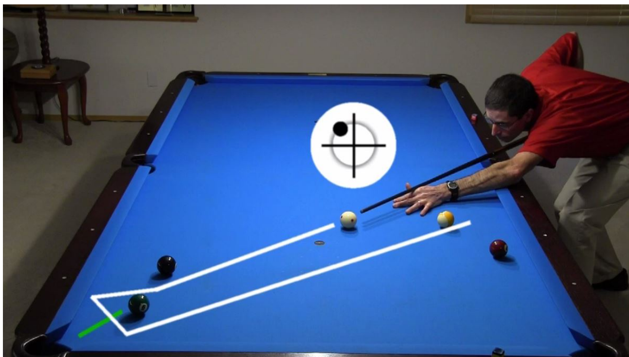
Diagram 4 Natural two-rail shape underneath a blocker.

Many more examples of a variety of common and useful two-rail position plays are presented in NV I.6 and on Disc III of VENT. The categories and approaches covered on VENT-III (“Position Play and English”) include no-rail shape, one-rail shape, two-rail shape, three-rail shape, position off pocket hangers, straight-in shot options, and end-game patterns.