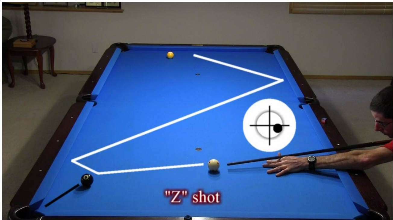
Diagram 1 “Z” shot two-rail position play

The topic for this month is important and common two-rail position plays, featuring shots demonstrated in online video NV I.6 (an excerpt from Disc III of VENT). Diagram 1 shows the layout for the first shot where the goal is to pocket the 8 and get position on the 9. Here, a good option is the shot illustrated in the diagram, where the cue ball (CB) goes across the table twice in a pattern shaped like the letter “Z.” This is a good play because the CB heads right into the line of the 9 ball shot, providing a large margin for error with shot speed. As illustrated in Diagram 2 , a wide range of speeds will result in a good shot at the 9.