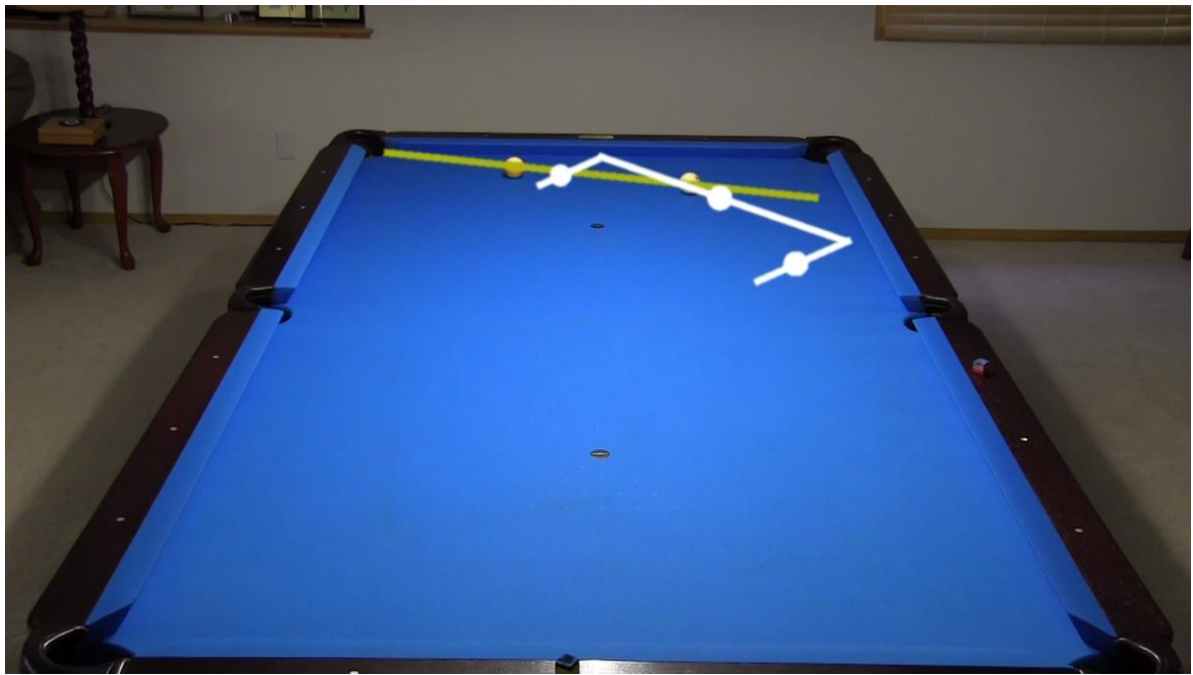
Diagram 2 “Z” shot large margin for error with speed

Diagram 3 shows the layout for the second shot, where the goal is to pocket the 6 and get shape on the 7. Online video NV I.6 demonstrates several reasonable options for this layout. One shot option is illustrated in the diagram, where running english and draw are used to come off two rails into the line of the 7. Another good option is illustrated in Diagram 4 , where inside follow is used to go two rails beneath the 8 and 9. This option is natural, and the braking action off the last cushion helps provide a good margin for error with shot speed. Check out the online video and try the shots yourself to see what might be your preferred choice. It is important to practice a wide range of position play shots and options so you will be more likely to make smart choices when you play.