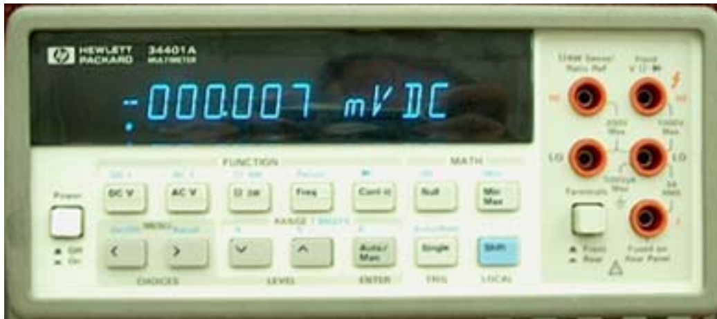
HP 34401A Digital Multimeter