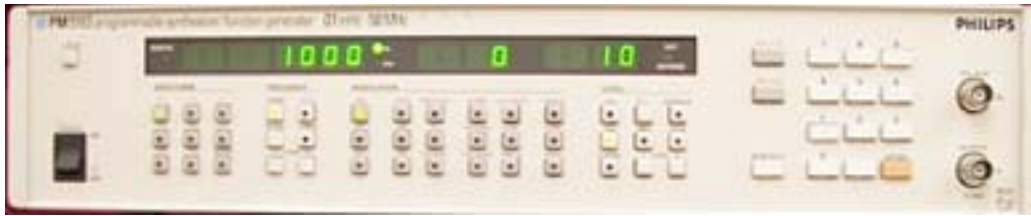
Philips PM5193 Programmable Synthesizer/Function Generator