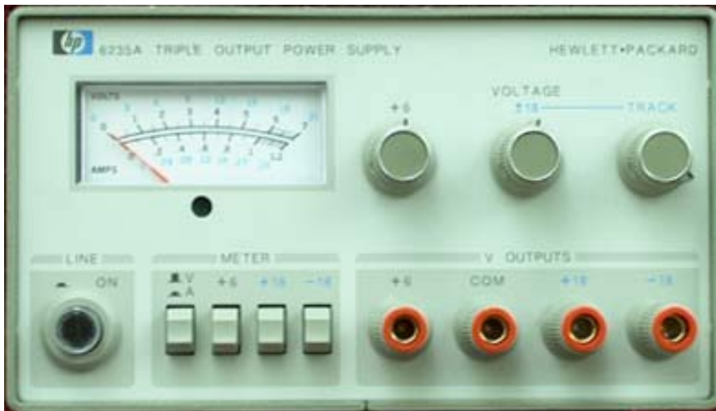
HP 6235A Triple Output Power Supply