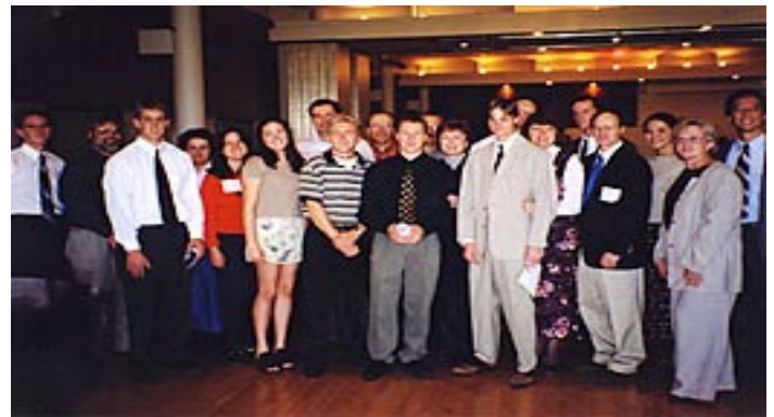
Congratulations 1998-99 Scholarship Recipients!

Visit the ME department at http://www.engr.colostate.edu/depts/me