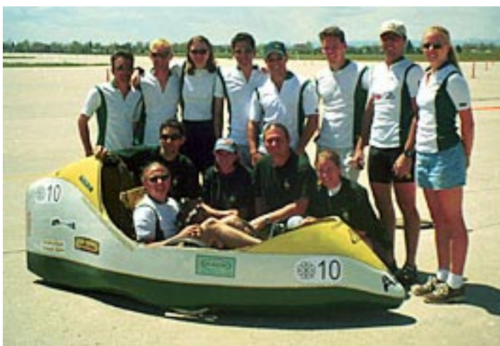
Human Powered Vehicle (HPV) Team, spring 1998