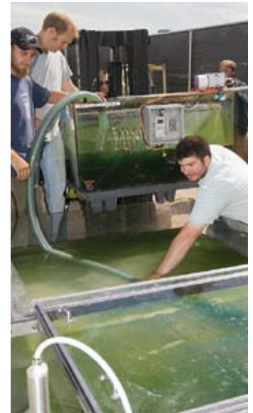
EECL researchers introduce first algae colony to Solix bioreactor.