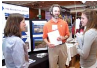
Students interact with Career and Internship Fair Company Representatives (see story on page 3).