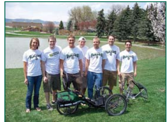
ASME Human-Powered Vehicle Team Reno, Nevada April 2008