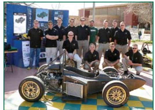
2007-2008 Formula SAE Senior Design Team