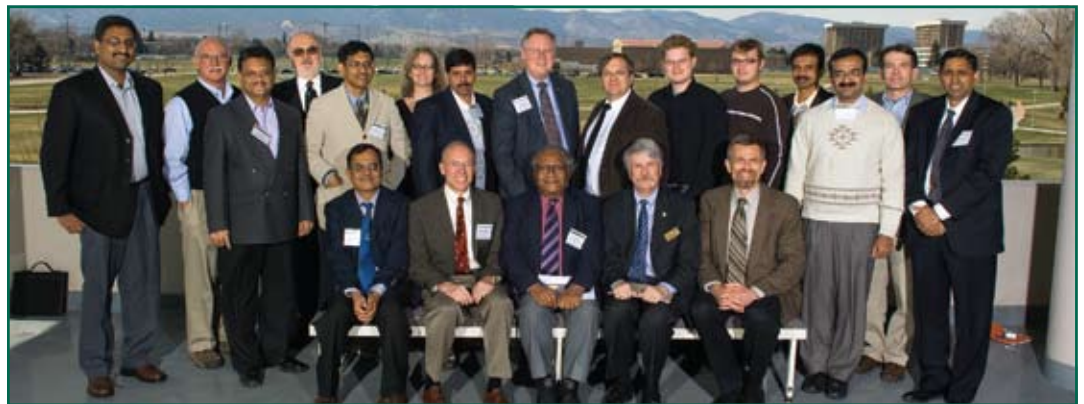
CSU-JNC Workshop Participants, April 2-3, 2008