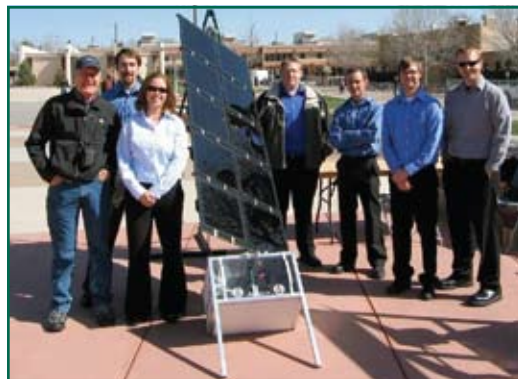
2007-2008 Single-Axis PV Tracker Senior Design Team