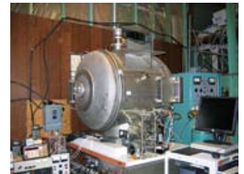
Emissive Membrane Ion Thruster Test Facility